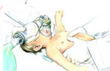
2 Rescuer Encircling Thumbs Technique