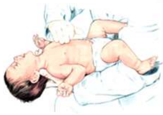
2 Finger CPR Hand Placement

Acceptable techniques for providing chest compressions: the two finger technique and the encircling thumbs technique. The encircling thumbs technique is preferred this technique may be superior in generating peak systolic and coronary artery perfusion pressure.**